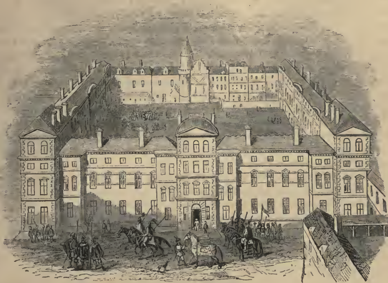
PALACE OF THE LOUVRE, as it appeared in the 16th century. From a print in Chastillon's Topographie Française .

John Baptist's feast, in the year 1388, at ten o'clock in the morning. The duke of Brittany entered Paris by the gate de l'Enfer*, and passing the whole length of the rue de la Harpe, crossed the pont de St. Michel, and came in front of the palace. He was handsomely accompanied by numbers of barons and knights; among whom was the lord William of Hainault, count d'Ostrevant: his brother-in-law John of Burgundy, and the lord William de Namur rode before him. When he arrived at the castle of the Louvre, he dismounted, and, as he passed through Paris, was much stared at by the common people.